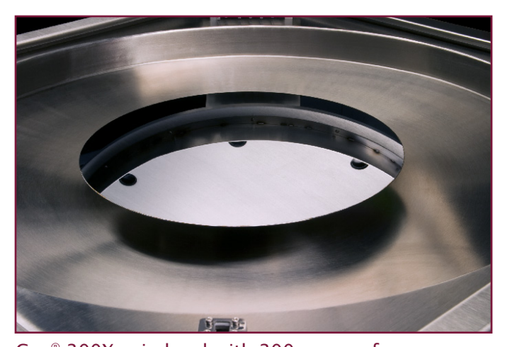
Cee® 300X spin bowl with 300-mm wafer

©2019 Cost Effective Equipment, LLC. All statements, technical information and recommendations contained herein are based on tests we believe to be accurate, but the accuracy or completeness thereof is not guaranteed and the following is made in lieu of warranty expressed or implied. Neither the seller nor manufacturer shall be liable for any injury, loss or damage, direct or consequential, arising from the use or inability to use the product. Before using, user shall determine the suitability of the product for his intended use, and user assumes all risk and liability whatsoever in connection therewith. No statement or recommendation not contained herein shall have any force or effect unless in an agreement signed by officers of the seller and manufacturer.