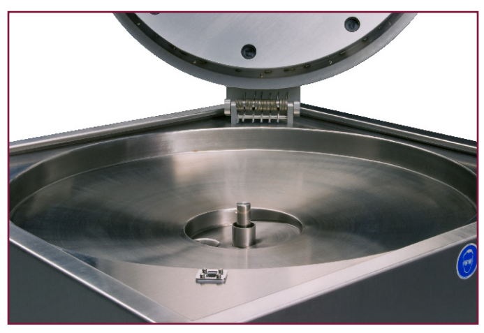
Cee® 300X spin bowl

▶ Nitrogen or CDA (for automated dispense): 70 psi